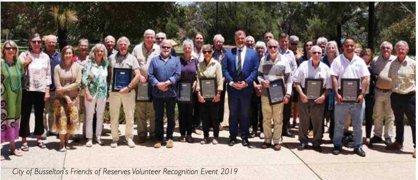
City of Busselton's Friends of Reserves Volunteer Recognition Event 2019

The City values the important role of volunteers and the ongoing activities of the Friends of Reserve Groups in caring for the City's reserves. We would like to recognise this important volunteer contribution to the environment by periodically celebrating individual or group achievements. If you would like to nominate an individual or Friends Group for a volunteer recognition achievement, please fill in the nomination form (Appendix B, Form 9).