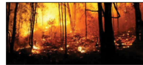
Actions speak louder than words and actions save lives

The hardest aspect of fire prevention is explaining to your family why you didn't undertake any!