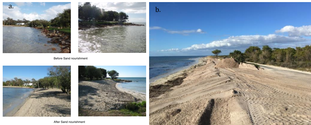
Figure 2: Sand nourishment at Bayview Crescent in Dunsborough (a) and Allen St, Broadwater (b).

Sand nourishment is also deployed rapidly in response to coastal erosion. This is typically the City's primary response to storm erosion. Placed sand is eroded but provides enhanced protection to the adjacent asset. Eroded sand is transported from the foredune to the nearshore areas (Figure 1) and alongshore to downdrift beaches.