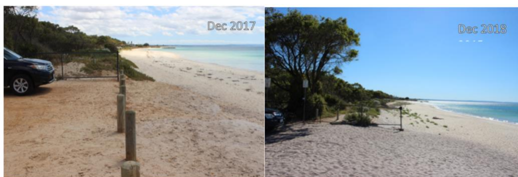
Figure 3 Asset relocation of the Mill Rd carpark in West Busselton has increased the erosion buffer and reduced nourishment requirements.

There will, however, always be a place for sand nourishment in the City of Busselton's management of coastal erosion, due to the speed with which sand nourishment can be implemented, its versatility and limited adverse impacts.